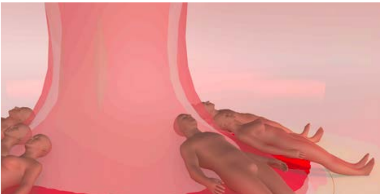
BREATH ing HEART - art installation of a walk-in heart at Art Basel 2017